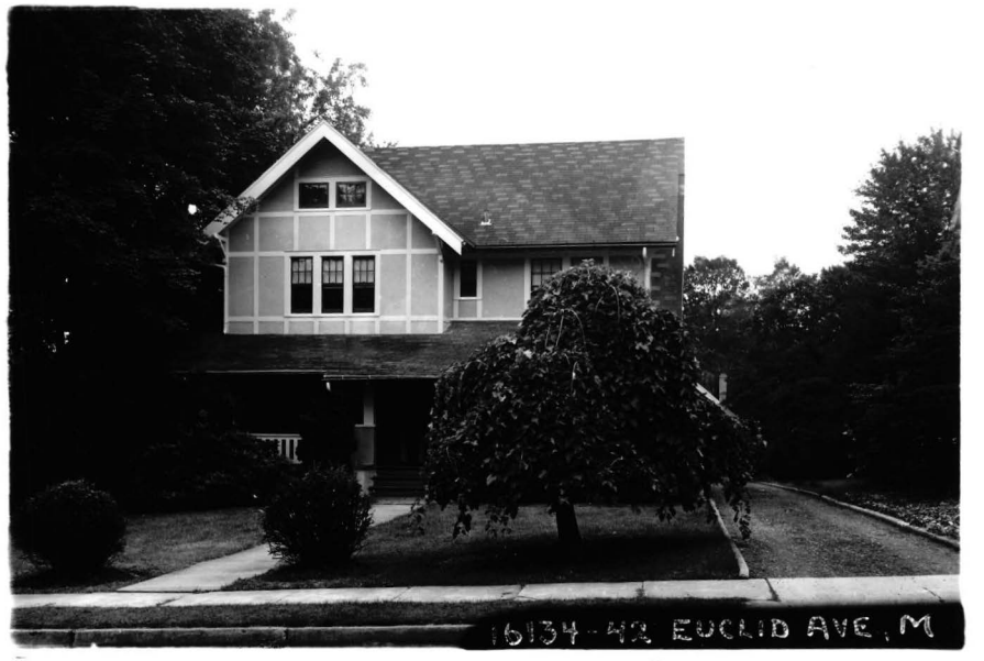
Board of Realtors of the Oranges and Maplewood. Photo by George B. Biggs. Inc